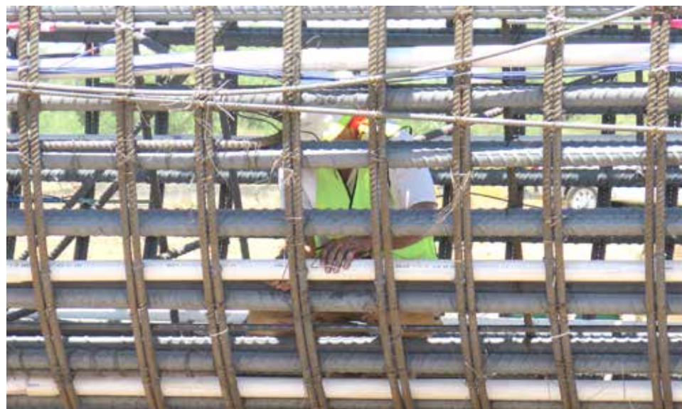
A worker with Martinez Steel cinches together a giant steel rebar cage that will be used to test concrete pilings for the high-speed rail construction project in the Madera area. Tests conducted by TPZP and its subcontractors will help in the design of a bridge that will cross the Fresno River.