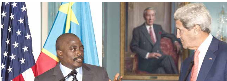
DR Congo President Joseph Kabila(L) delivers remarks to the media with US Secretary of State John Kerry after their private bilateral meeting at the US Department of State on Monday.

US and African political leaders and corporate chiefs will get down to business Tuesday as Washington hopes an historic summit will trigger a surge in trade and investment between the two sides.