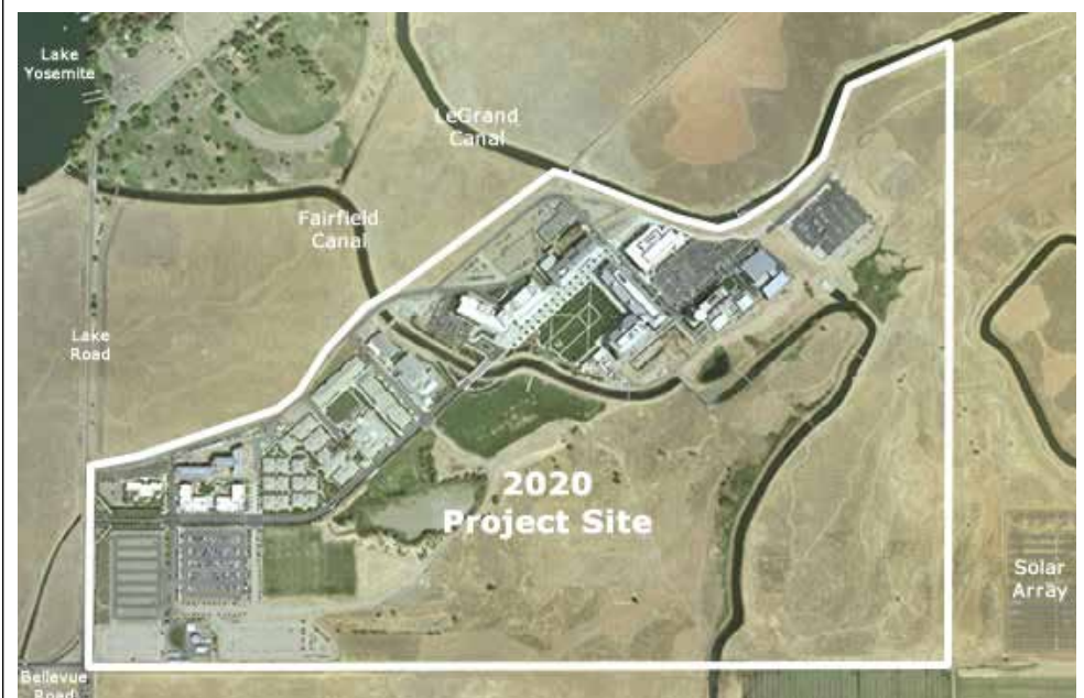
The UC Merced 2020 project will be built on the 219-acre campus site.