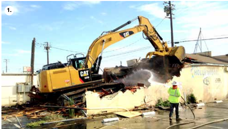
1. J. Kroeker Inc. , a subcontractor to TPZP, demolishes the blighted Hollywood Inn bar in Fresno on July 14 to clear the way for future high-speed rail structures. J. Kroeker Inc. is a women-owned small business headquartered in Fresno.